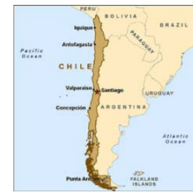
Water and Sanitation Chile