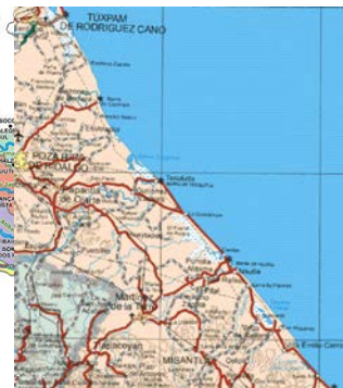
Water and Sanitation Xalapa/Veracruz/ Mexico